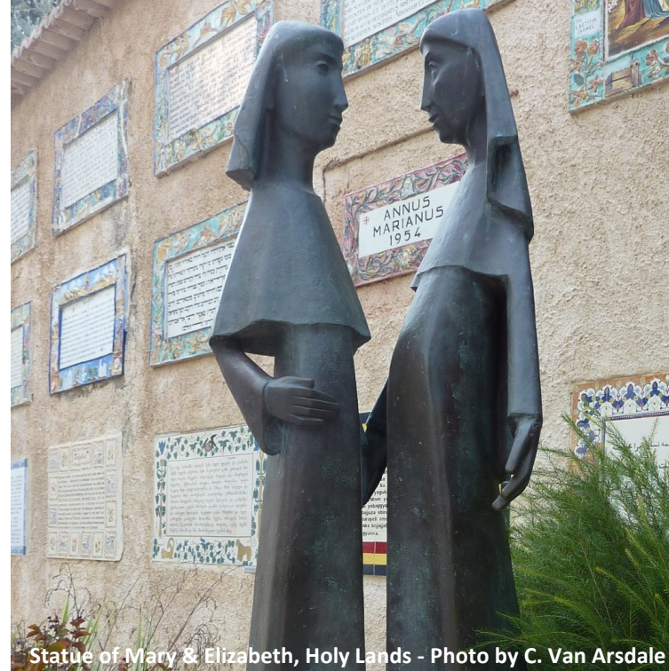
Statue of Mary & Elizabeth, Holy Lands